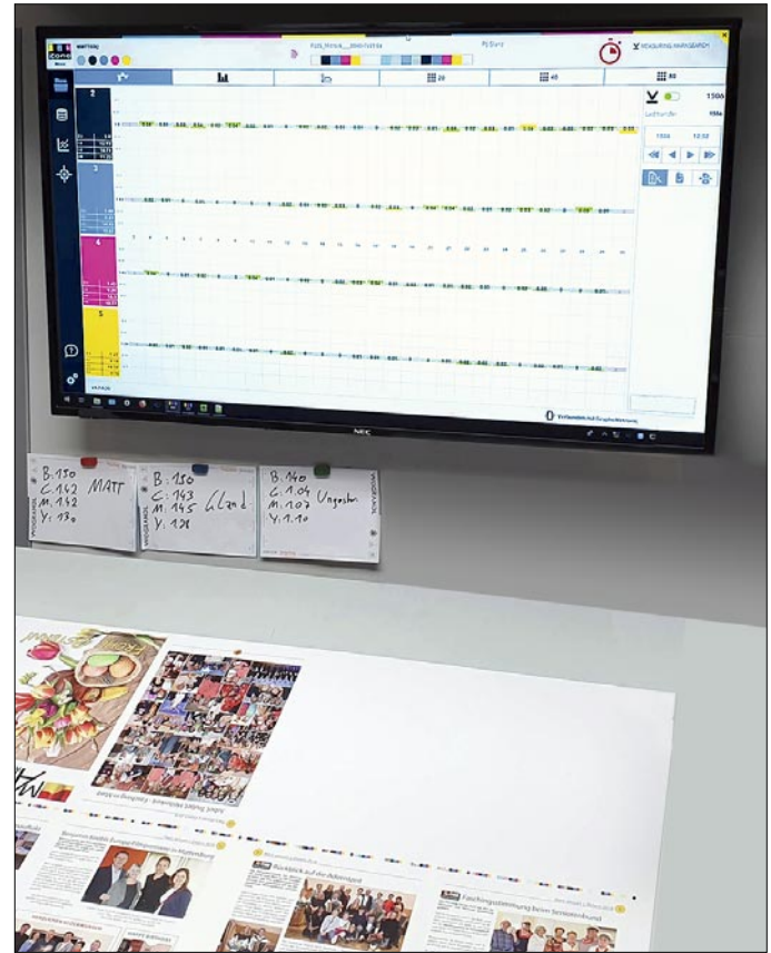
InkZone Loop Inline ensures quick and accurate color matching.