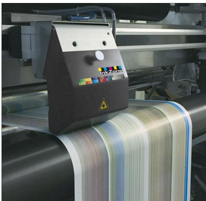
InkZone Inline for web...

Inline color measurement and press control offers the possibility of collecting much better color data quickly and without additional work. The presses are capable of running continuously during the complete offset printing process without the need to stop and pull sample sheets. Management and press operators are able to get data that accurately reflects the color of a job throughout the complete press run. InkZone Inline is an important tool that helps to streamline the printing process and allows for complete quality monitoring.