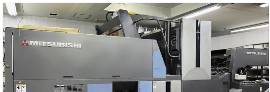
Inline quality inspection and color measuring device installed left from the upper printing unit.