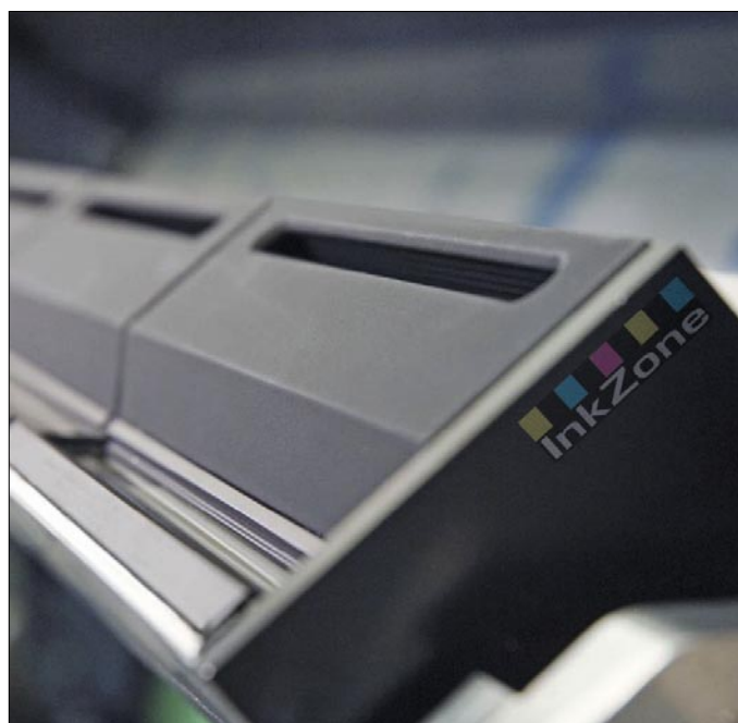
... and sheetfed offset presses