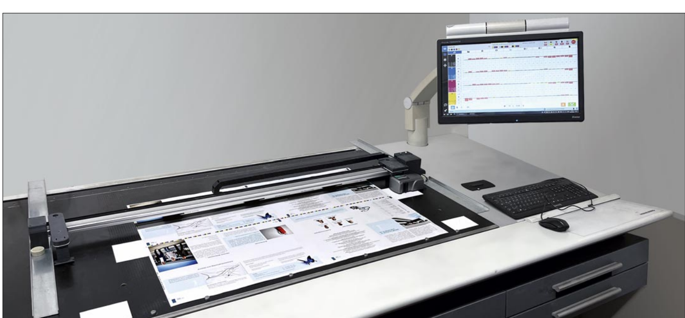
InkZone Loop is compatible with almost all press consoles.

So, once the operator checks the color results and the recommended press adjustments, at the touch of a button the ink keys for all printing units can be adjusted automatically. This can lead to results that are clear: a significant reduction in makeready and run waste, higher overall color quality, and consistent, stable production runs.